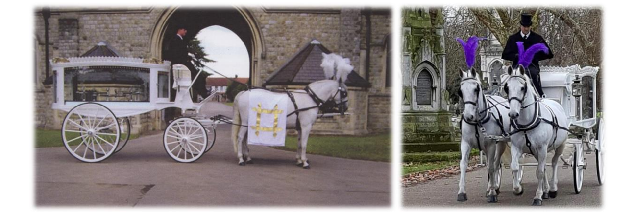
Pair of white horses with white hearse