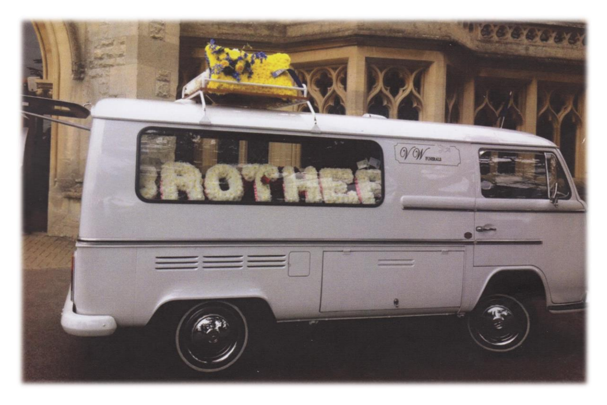
Original 1972 Volkswagen Bay VW hearse