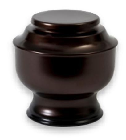
Bronze on Aluminium