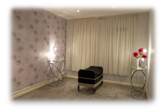
Chapel Of Rest