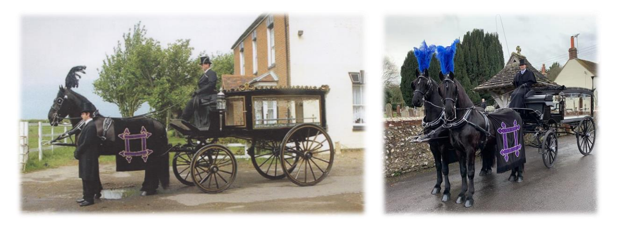
Pair of black horses with black hearse

We can supply a variety of horse-drawn hearses with either a pair, or a team of four or six horses. There are white and black hearses available. Horse plume colours can be specified.