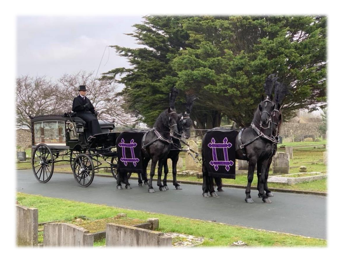
Team of black horses with black hearse